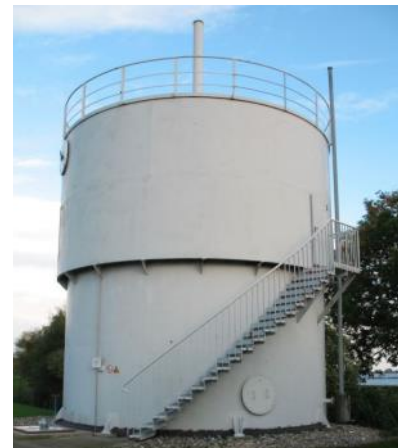
Refurbishment gas depot

Stainless steel tanks and enamelled tanks can be supplied from 8-14.000 m 3 . The tank material is selected according to the ingredients of the medium to be stored. In most cases will be decided between trifusion, ASI 304 and ASI 316. Alternative stainless grades and enamelled grades are available.