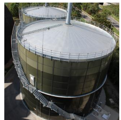
Mainz central treatment plant Low pressure gas depot 55 mbar Volume: 2,500 m 3 and 3,700 m 3