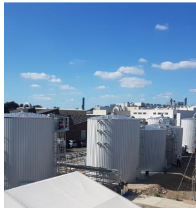
Heinsberg, 2019 Tanks, Volume: 2x 188 m 3 , 138 m 3 and 246 m 3