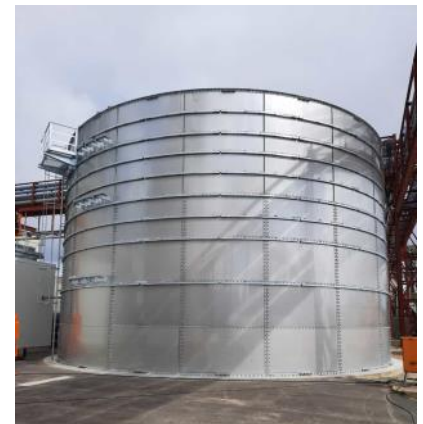
Beeskow, 2019 Digester Volume: 1.611 m 3