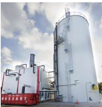
Veghel, Netherlands, 2014 Sewage Volume: 1.255 m 3