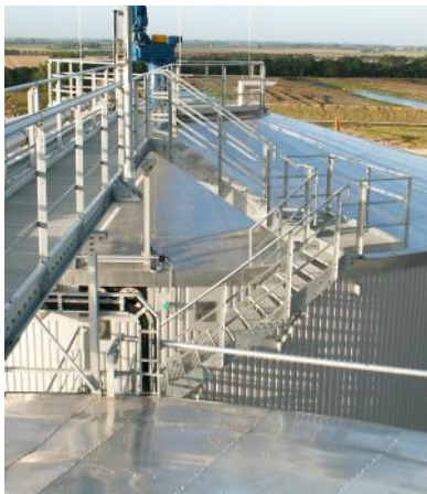
Steelwork, helical staircases running boards