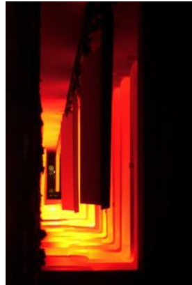
enamel is burned in