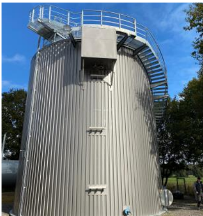
Drensteinfurt, 2020 Digester, Volume: 659 m 3