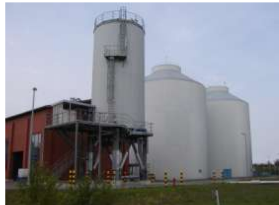
Sewage plant Wansdorf Thick mud tank Type 20 42,5 on supporting structure 6 m over floor