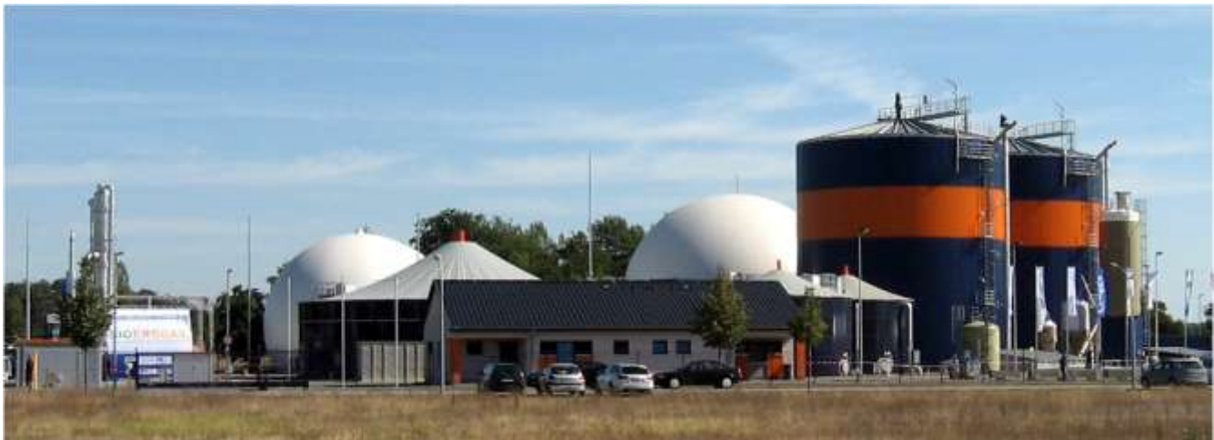
GreenGas Production site Rathenow

2x biogasfermenter Type 59 70, combination tank Type 70 20, balance tank Type 34 20, fugat tank Type 34 20, final substrate tank Type 81 20