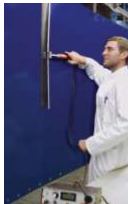
checking of the enamel sheet