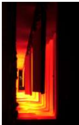
enamel is burned in